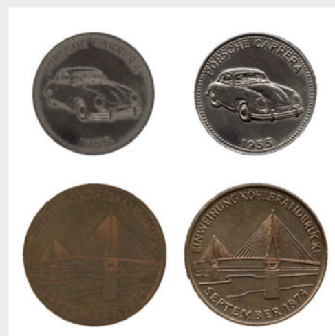
2D scan versus 3D scan, capture all details