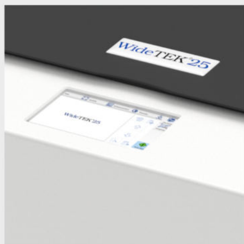
Large color touchscreen for simplified operation